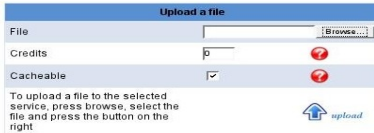
Illustration 2: Uploading a file using the Bluevibe Manager